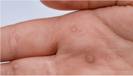
WARZIN WART REMOVER

Warts are a common dermatological problem. Warts are characteristic skin or mucosal growths caused by human papillomavirus (HPV). Although they are usually harmless, warts can cause significant discomfort, pain and aesthetic discomfort. In addition, HPV, especially some types, is associated with an increased risk of cancer. This article reviews wart removal methods, their effectiveness, and strategies to help you avoid the risk of developing warts.